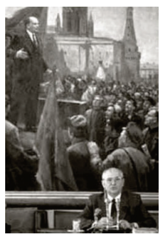
Figure 1 The end of the Soviet Union: Mikhail Gorbachev at a press conference, Moscow, July 1991