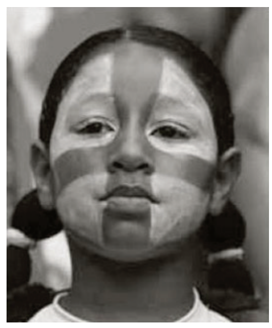
Figure 2 An expression of the English nation: a young football fan watches England v. Iceland

We can see that the problem with so-called objective approaches to defining a nation is finding sound criteria by which one might judge which groups form nations and which do not. How can we weigh different histories, traditions, religions, languages? Any attempt at objective demarcation of national communities is sure to remain contested, not least from among the groups who are thus classified.