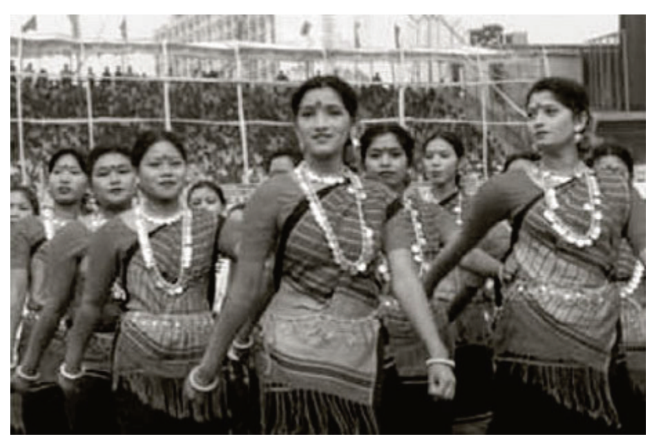
Figure 5 Celebration of a nation: Bangladeshi women parade at a ceremony celebrating the thirtieth anniversary of the declaration of independence from Pakistan, March 2001

globalisation does involve large-scale trends which add up to a significant challenge to our dominant national conceptions of political community. David Held (2000) has recommended that we adapt democracy so that new 'constituencies' that cross national boundaries can be recognised and their members participate in decision making on cross-border issues. He and others have also advocated global government through a world parliament and other institutions. Such views see the community as made up of those affected by certain actions or phenomena, regardless of their territorial location and loyalties. It is people affected by, for example, AIDS, acid rain and global warming, who form a new sort of 'constituency' and a new type of collective interest. The concern here is about people in different countries, drawn together in new forms of 'political community' by having a stake in the outcome of pressing cross-border issues, and the need to downgrade more rigidly national-territorial (and to some degree also legal) definitions of political community.