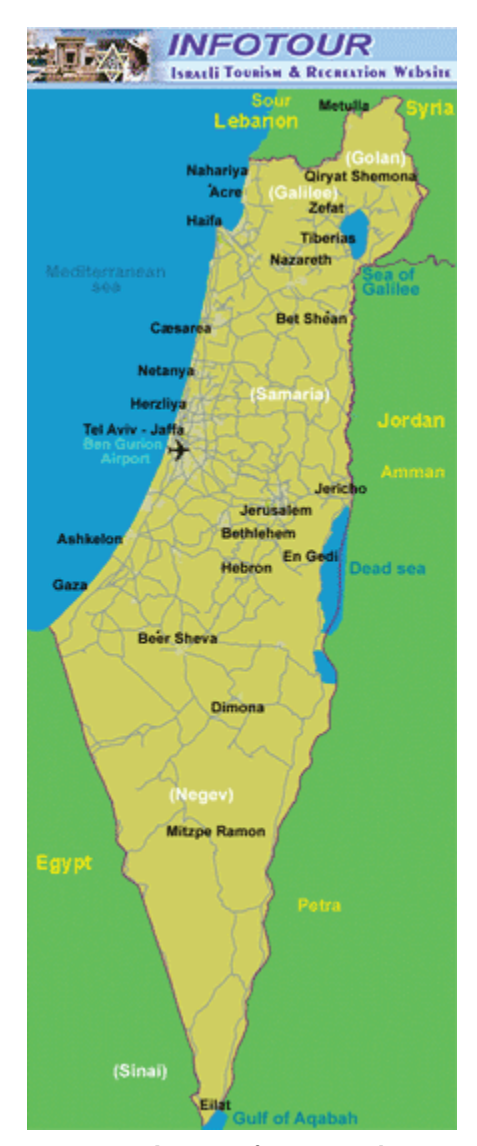
Figure 3 Visual images of a nation: website displaying map for Israeli tourism

There is a large version of the Israeli Tourism map [PDF].