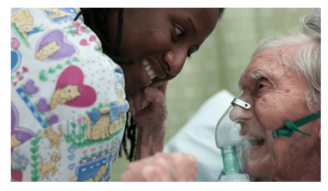
Sermoneta / CC-BY-NC-S A 2.0

Many open educational sources offer images that can be used for educational purposes. For example, Flickr is Creative Commons licensed and images can be downloaded and printed for educational purposes. The following is an example of an image used to provoke discussion and to challenge embedded attitudes related to aging.