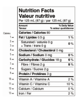
Figure 2: Sample Nutrition Facts table (bilingual standard).

The NFT displays the % DV so consumers can determine the amount of a certain nutrient in one serving. The list of ingredients is mandatory on most packaged foods that contain more than one ingredient, and ingredients are listed in order of weight. In general, it is mandatory to show both official languages of Canada (French and English) on labels, with some exceptions (e.g., specialty foods, local foods, test market foods, and shipping containers) as long as the products are not resold to consumers.