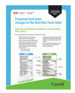
Figure 3: Proposed changes to the Nutrition Facts table.

Changes or improvements to the nutrition facts tables have not been finalized yet, but the aim is to have the new regulations implemented sometime in 2015. The application of the new labelling policy may be at a later date as the proposed changes have only completed the consultation and consumer feedback stage. A full report is available on Health Canada's website under What We Heard.