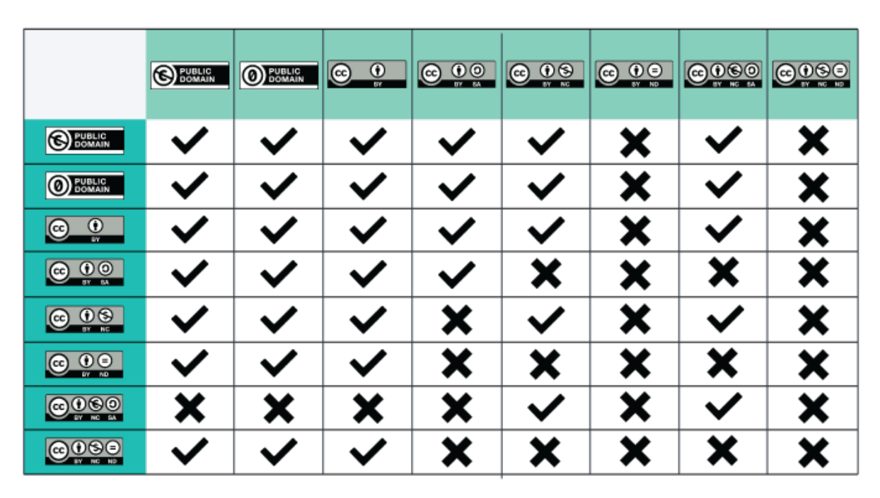
Figure 2.4.1 Creative Commons License Compatibility Chart by Laura Underwood Adapted from Kennisland (2013)