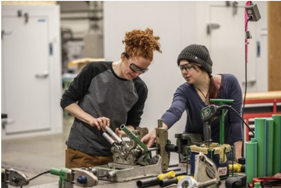
Figure 3.1 Giving and receiving feedback includes being aware of body language and facial expressions.

If half of communication is listening, the other half is speaking and expressing thoughts and feelings in a clear way. Sending effective messages includes both verbal communication (the words you use) and non-verbal communication (body language).