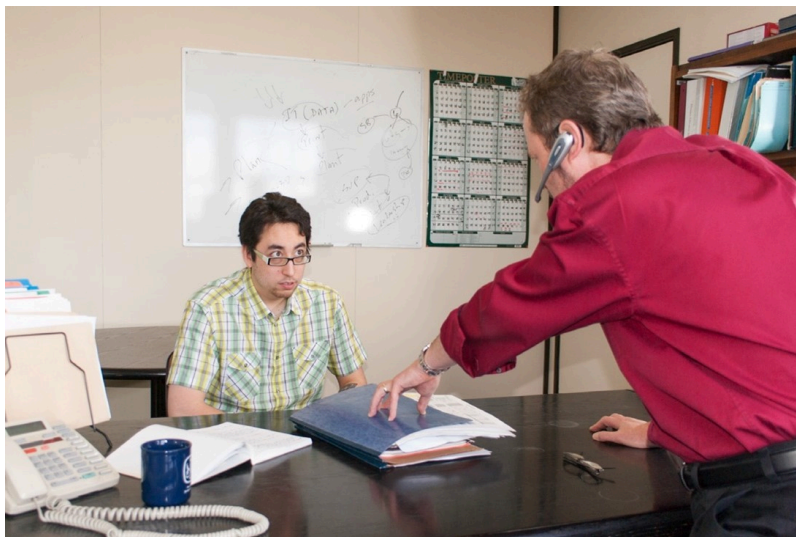
Figure 4.1 Being assertive does not mean being aggressive

Assertive communicators are direct, firm, honest, and clear about their ideas and wants while not discounting the ideas of others. They typically express ideas in a thoughtful and polite way, while respecting the values and opinions of others. If there are disagreements regarding views, the assertive communicator will typically use “I feel” statements rather than accusatory or “you” statements to resolve the disagreement. Assertive communication is respectful—even when you are expressing negative emotions, you don’t hurt others. When you communicate assertively, you express your needs, wants, thoughts, and feelings without guilt. When you communicate assertively, you take responsibility for your thoughts and feelings and state your position with confidence. This is widely considered to be the most effective style of communication as it does not create unnecessary conflict and allows for all ideas and views to be shared.