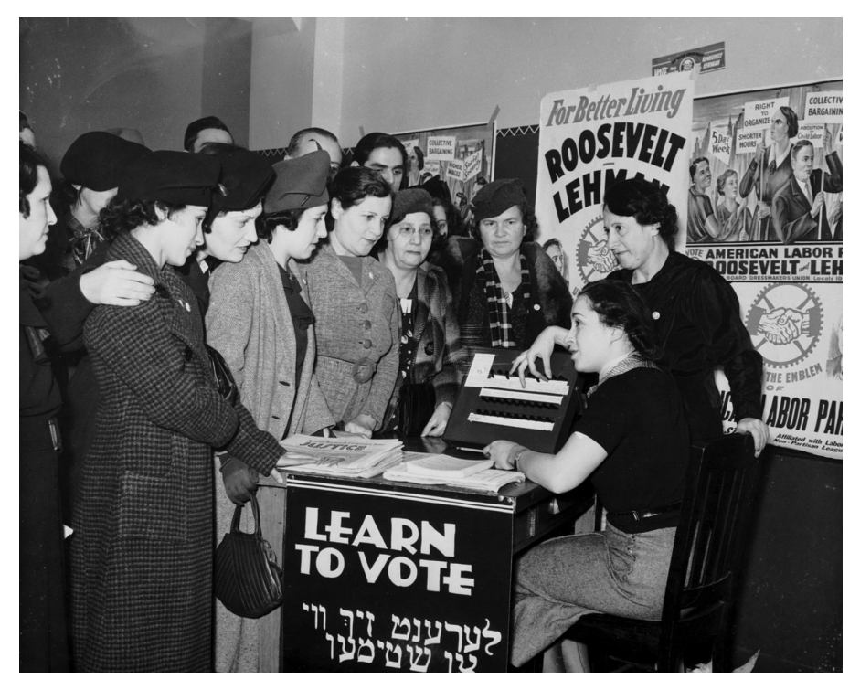
Women learning to vote

people be trusted with politics? Big crowds came to see Nellie's play. They roared with laughter. It became fashionable to support women's rights.