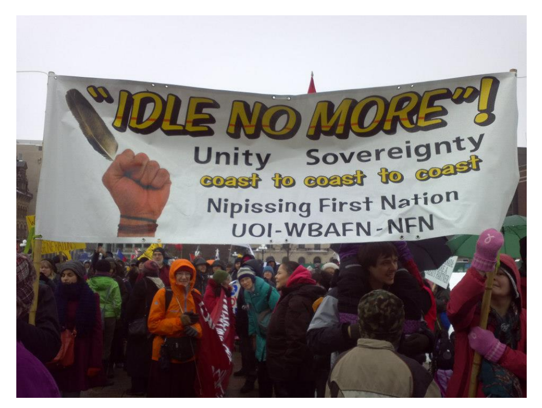
Idle No More

Elijah Harper inspired a new wave of First Nations people to take part in politics. He paved the way for movements like Idle No More, which was just getting started when he passed away in 2013. The eagle feather that was laid to rest the day he died has been picked up once more.